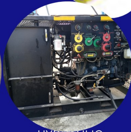
HYDRAULIC POWER PACK UNIT