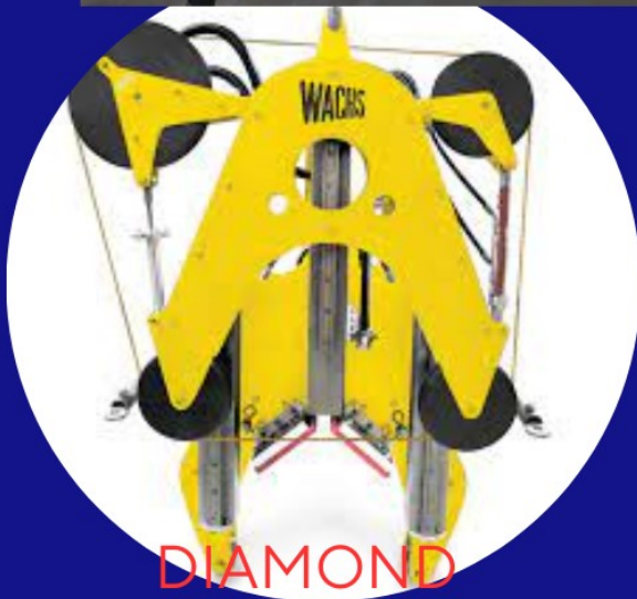
DIAMOND WIRE SAW