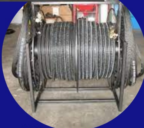
HYDRAULIC HOSE REEL